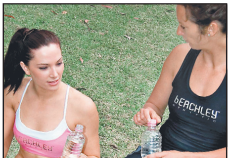
Own label . . . Layne Beachley (right)