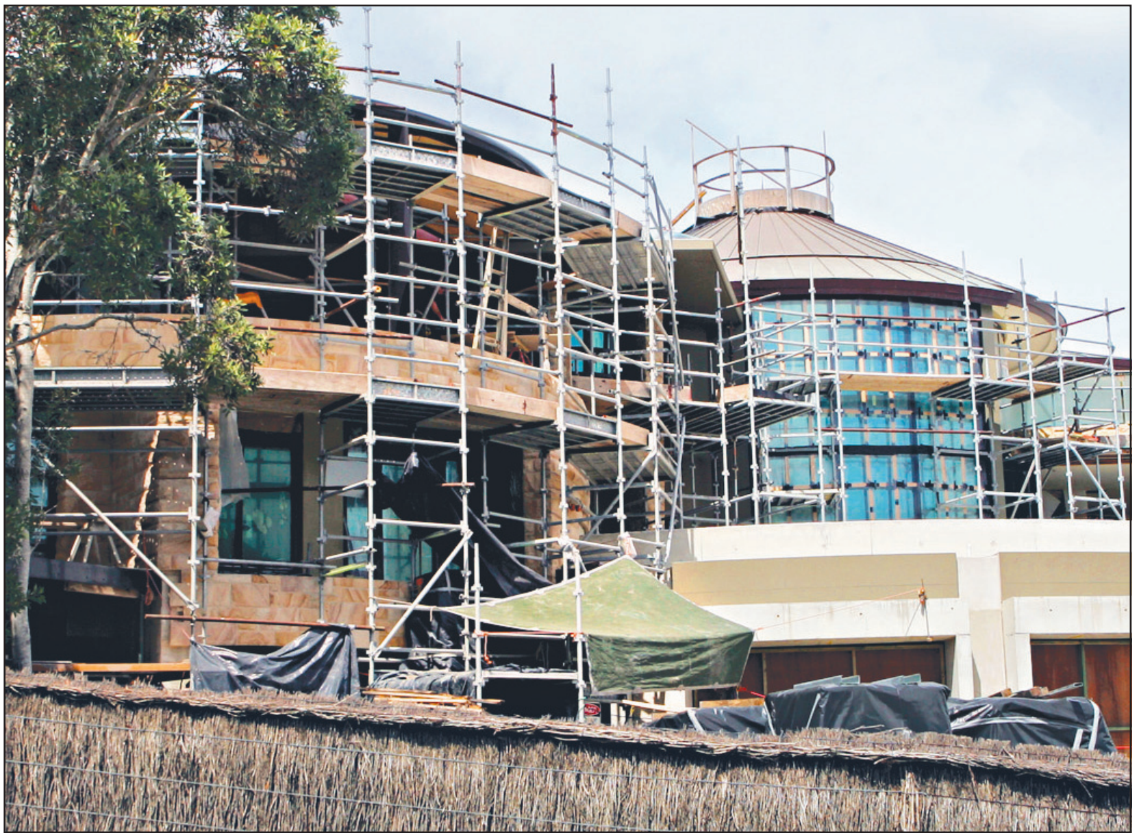
Ocean home . . . the design of the three-level home has even won the neighbours' approval.